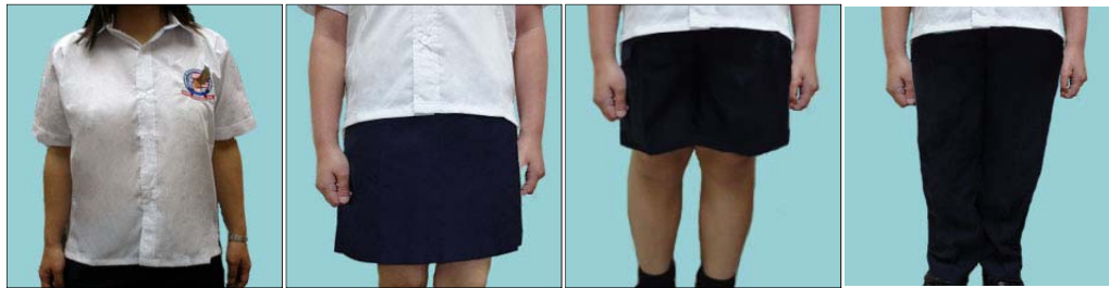
Short sleeved shirt with school emblem Navy blue culottes G1 - G12 Girls Navy blue shorts G1 - G4 Boys Navy blue pants G5 - G12 Boys