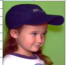
P.E. Hats G3 - G4